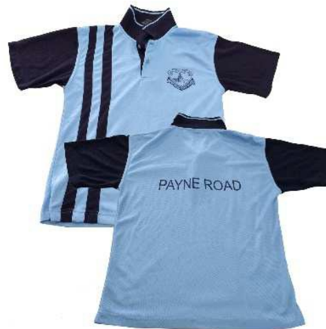
District Representative shirt (provided by school)