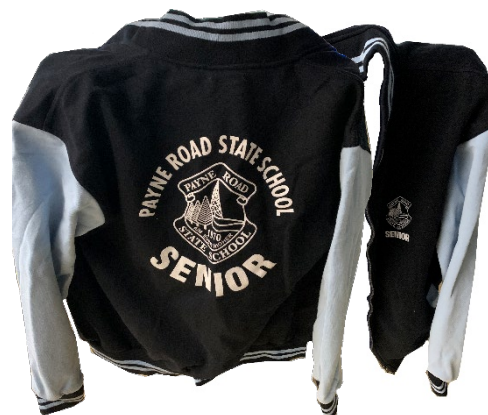
Year 6 Senior Jackets