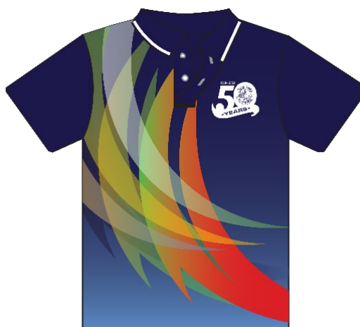
Year 6 senior shirts change design each year