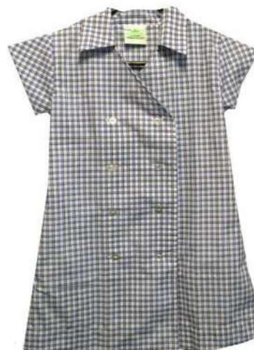
School Dresses are not for Prep